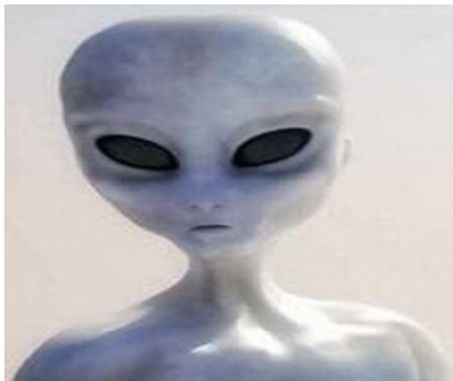
Figure 6: small grey

Small Greys were about 3.5' tall and usually took directions from tall Greys and/or Mantis Ebens