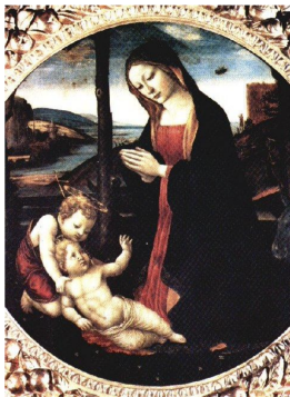
Madonna and the birth of St. Giovaninni

If the provenances of famous painting are valid, such as, The Fifteenth Century Painting of Madonna and the Birth of Saint Giovaninni, what are the implications for our real history?