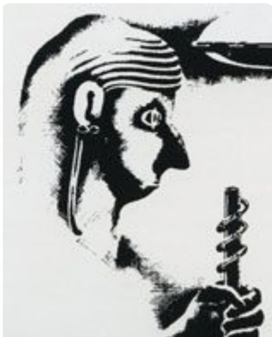
Figure 4: Archquloid from Planet Pontel with universal translator device in hand