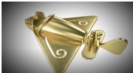
Ancient Mayan artifact of a flying machine