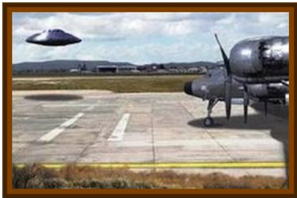
Figure 5: Archquloid saucer landing at Muroc (now Edwards) AFB