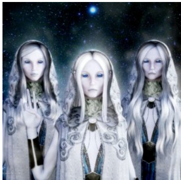
Figure 8: Pleiadians are descendants of the Lyrans