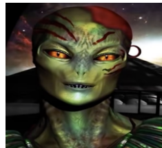
Lacerta: a humanoid reptilian reportedly interviewed in Sweden on youtube