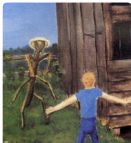
Mantis alien confronting young boy