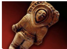
Ancient Mayan artifact of a possible alien visitor in space suit