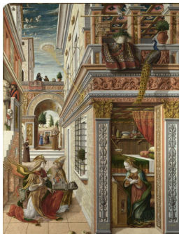
Figure 2: 1486 Renaissance painting by Carlo Crivelli