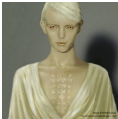
Figure 13: Tall White, Nordic, Telosian