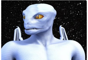
Winged Draco Reptilian.