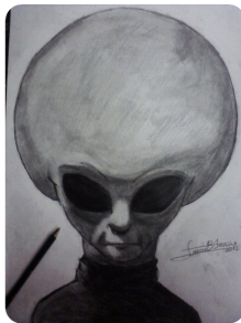
Figure 14: "Skinny Bob"