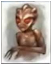
Figure 16: Photo of captured ET, exposure to whom led to man's death in Brazil about 23 days thereafter