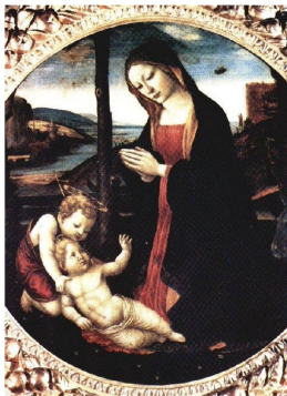
Madonna and the birth of St. Giovaninni

If the provenances of famous painting are valid, such as, The Fifteenth Century Painting of Madonna and the Birth of Saint Giovaninni, what are the implications for our real history?