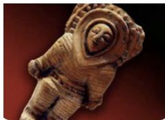
Ancient Mayan artifact of a possible alien visitor in space suit

Alternatively, they may have been artistic attempts to describe aspirations of the capability of flight to man rather than to describe the appearance of E.T. visitors to this planet.