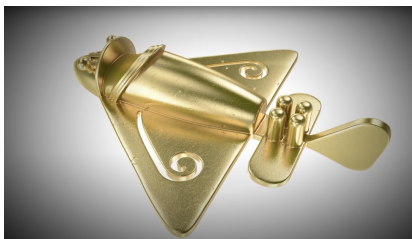
Ancient Mayan artifact of a flying machine