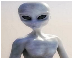
Figure 20: small greys, occasionally reported to be taking orders from Tall Greys or Mantis insectoids