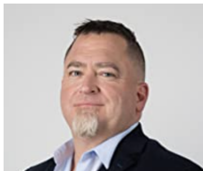
Figure 1: Former Pentagon chief of Advanced Aerospace Threat Identification Program identified five observable criteria