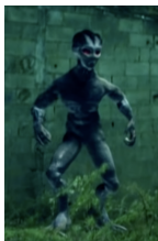
Figure 32: EBEN similar to that in Figure 31 spotted by three Brazilian women taking a walk