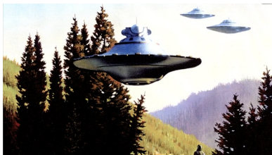
Figure 25: Photograph of SemJase's Beamship

This photo was vouched for by Lt. Col. Wendelle C. Stevens, in his Contact from the Pleiades, Vols 1 and 2.