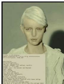
Figure 28: Tall White, Telosian