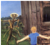
Mantis alien confronting young boy