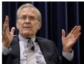
Figure 2: Secretary of Defense, Donald Rumsfeld

Rumsfeld's Feb. 12, 2002 DOD briefing exploring knowledge's limits