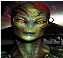
a Reptilian or Hephraloid species