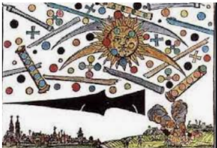
Figure 5: 1561 Broadsheet of sky-battle over Nuremberg by Has Wolff Glaser [3]