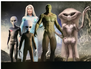
Figure 14: Five of the visiting E.T. species—specifically, a Grey, Eben, Nordic, Heplaloid, and a Trantaloid