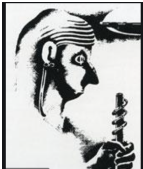
Figure 17: Archquloid from Planet Pontel with universal translator device in hand