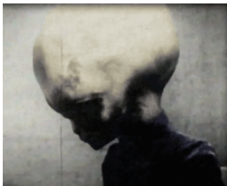
Figure 16: "Skinny Bob"