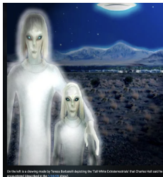
Figure 11: Drawing by Teresa Barbatelli of Tall Whites as described by Charles Hall, Jr.