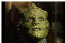
Lacerta: a humanoid reptilian interviewed in Sweden on youtube