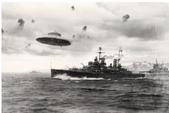
Cruiser Minotaur fights against a flying saucer.

Figure 29: Haneubu saucer attacking the U.S.S. Minotaur during Operation High Jump